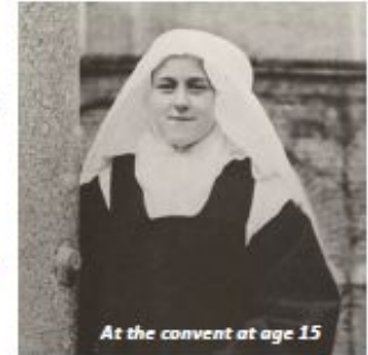
At the convent at age 15

Her two sisters' entrance to the Carmelite monastery in Lisieux intensified Thérèse's desire to enter the religious order, as well. Not wanting to wait until the age of 16, she traveled to Rome with her father to ask the Pope for a special exemption to enter earlier. Her request is granted a few months later by the local bishop, and Thérèse enters the convent on April 9, 1888, at age 15. Within a year she receives her habit, and is assigned to care for the dining hall and sweep the corridors. In 1890 she takes her vows. Thérèse devotes herself to prayer and to the service of God in the monastery, striving to be as generous as possible, always offering all of her "little" efforts to God. In 1894, on the morning of Good Friday, Thérèse is diagnosed with tuberculosis which was the start of a painful three years of intense suffering.