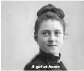
A girl at home

Today is the feast day of my favorite saint – Saint Thérèse, who we call The Little Flower . On January 2, 1873, Marie Françoise Thérèse Martin was born in Alençon, France to two devout Catholic parents, and the couple's intense love for Catholicism and for religious life was passed on to their children. When Thérèse was four, her mother died. Shortly afterwards, the family moved to the town of Lisieux. As a young girl Thérèse led a sheltered life, living under the loving care of her devoted father and being treated with great tenderness by her four older sisters. Thérèse was a sunny child and a naturally religious one as well. "I loved God very much," she would later write about this period, "and offered my heart to him very often."