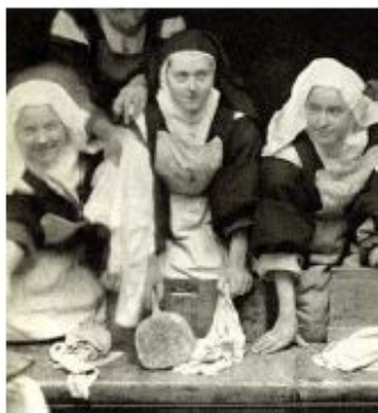
In the center – scrubbing floors

During this same year, her father dies, and she was asked by her superior to write what would become her spiritual testimony. She titles it Springtime Story of a Little White Flower Written by Herself . Her book is what gives her the name Little Flower , and reveals both the pain and joy that accompany a life of faith. It is this book about how she devoted herself to prayer, to the service of God in the monastery, striving to be as generous as possible even during her illness, that will ultimately draw millions of believers to Jesus, through Thérèse. As she continues writing, her physical condition deteriorates. The last few chapters are written during a period of extreme suffering.