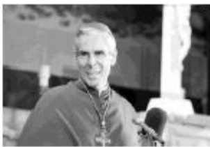
The Venerable Fulton J. Sheen

During the first part of the twentieth century, it was common for Catholics, young and old, on their way home from work or school, en route to the grocery store, or a sports practice, to "stop in for a visit" to the Blessed Sacrament in their local church. Most times the Eucharist was not exposed, but a red candle – then, as now – showed the Lord's Presence in the tabernacle. Since the Second Vatican Council, the Catholic Church has made Eucharistic Exposition and benediction a liturgical service in its own right and exercised more direction over its practice. It draws its primary meaning from the Eucharistic celebration or Mass, itself. "The documents of the Council tell us that "by worshiping the Eucharistic Jesus, we become what God wants us to be! Like a magnet, The Lord draws us to Himself and gently transforms us."