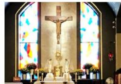
God is good – all the time!