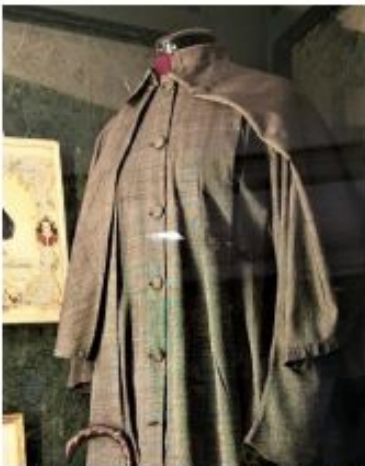
Saint Frances Cabrini's habit and cane on display at the museum in the Shrine of Mother Cabrini in New York

She petitioned Pope Leo XIII to allow her and her sisters to travel to China as a missionary – her lifelong dream – but the Pope told her not to go East “but West.” Frances hesitated, for as a child, she was always frightened of the water, unable to overcome her fear of drowning, and dreaded travelling across the ocean. But she obeyed the Pope and traveled with six sisters to New York City to work with the thousands of Italian immigrants living there. But Mother Cabrini found disappointment and difficulties with every step. When she arrived in New York City, the house intended to be her first orphanage in the United States was not available and the archbishop advised her to return to Italy. But Frances, truly a valiant woman, departed from the archbishop’s residence all the more determined to establish that orphanage. And she did.