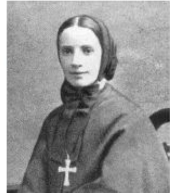
Saint Frances Xavier Cabrini