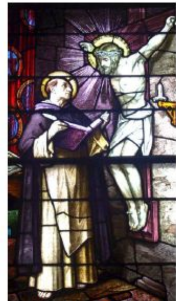
St. Thomas Aquinas, Pray for Us!

But by 1243, Thomas abandoned his family's plans for him and joined the Dominican Order, much to his mother's dismay. Angered, she ordered Thomas' brothers to find and capture him and bring him home, where he was kept at the Castle of Monte San Giovanni Campano for over a year against his will. Once free, he went to the University of Paris where he finished his studies with Saint Albert the Great. Because Thomas was quiet and didn't speak much, some of his fellow students thought he was slow. But Albert prophetically exclaimed: "You call him the dumb ox, but in his teaching he will one day produce such a bellowing that it will be heard throughout the world."