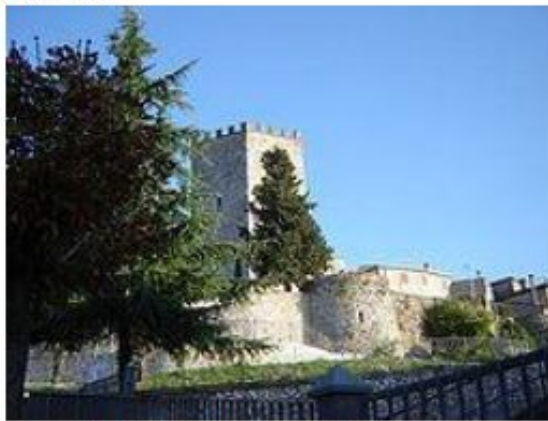
The Castle of Monte San Giovanni Campano